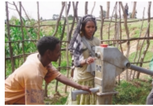
Water pump in Harerghe

Food aid was generally reported as linked to 'food for work' programmes. Benefits were that people could work locally rather than migrating, that some work is useful (soil conservation, ponds, forestry) and encourages a work