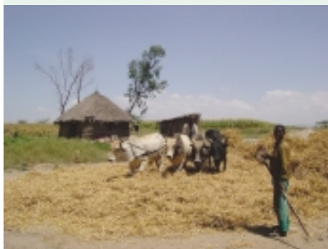
Threshing with oxen in Arssi