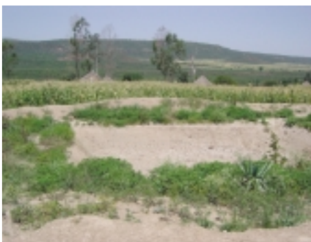
Failed water-harvesting in Arssi

Regular dependence on food aid was reported from nine communities, in one case going back many years, in others beginning around 2000.