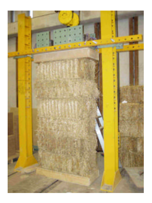
Figure 2 Settlement test set-up

In preparation for static testing to failure two of the test walls were subject to a dead loading of 16.6 kN/m<sup>2</sup>, figure 2. Vertical settlement of the panels was measured periodically for up to 74 days. Results of these settlement tests are reported below.