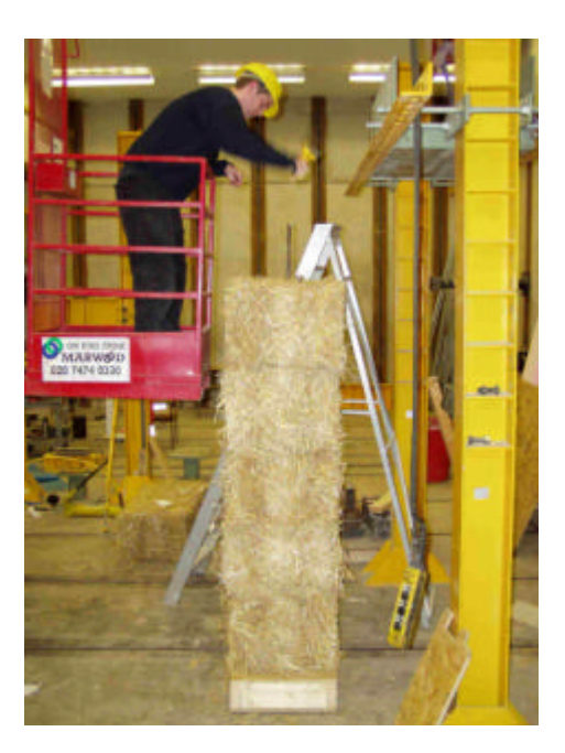
Figure 1 Wall construction