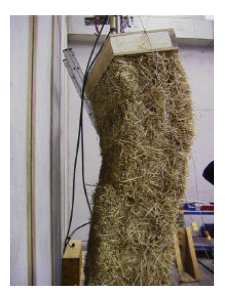
Figure 6 Buckling failure