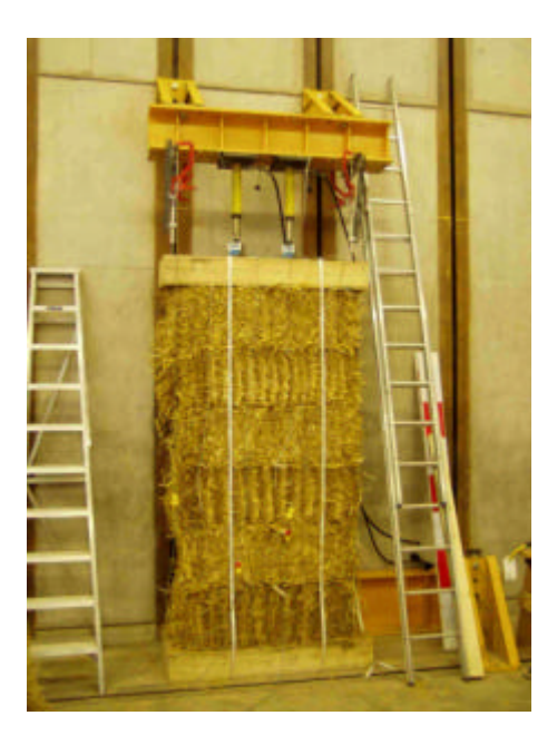
Figure 3 Static load test