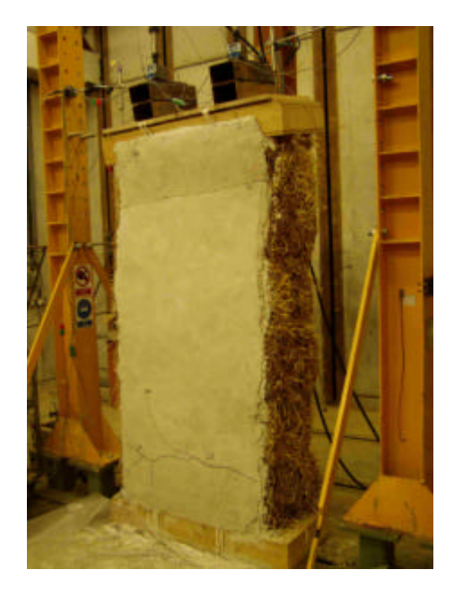
Figure 8 Lime rendered wall failure

lime render cracked. The wall failed as a result of the lime render separating from the straw on one side beneath the top plate. Though the lime render was applied to the straw bales outside the full width of the top bearing plate, a slight bearing of the top plate onto the edge of the render of one side resulted in unequal settlement of the top plate, figure 8, contributing to the observed failure mode. Other failure modes reported for rendered walls include overall buckling of the wall, local buckling of the plaster, and bearing failure of the plaster [2].