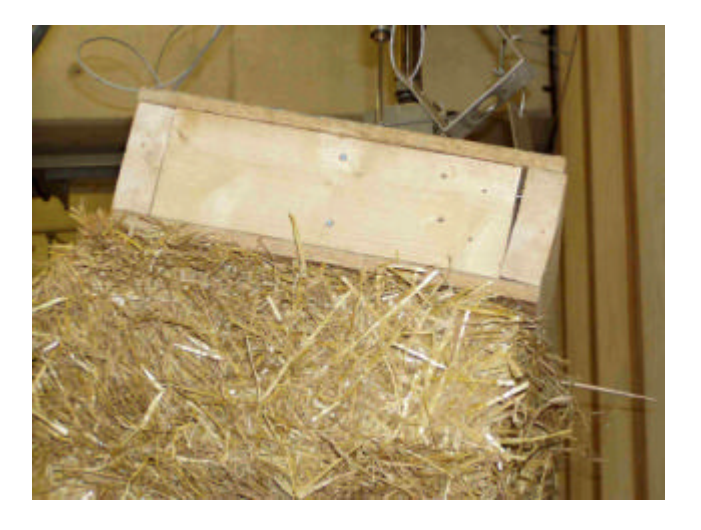
Figure 7 Rotation of wall plate

The standard bale construction wall settled under increasing load with little change in stiffness until a maximum load of 27.6 kN was reached. As expected the initially precompressed wall exhibited increased stiffness compared to the standard construction, table 2, though the maximum load was reduced although higher than both the halfbale and no hazel wall tests.