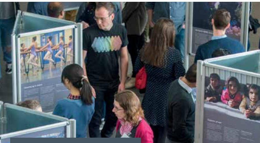
Researchers developed networks and heard new perspectives through a variety of engagement activities