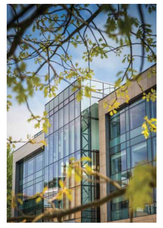
10 West opened in July 2016.

The £4.5 million transformation of 18 Manvers Street in Bath city centre has continued to make good progress and will open to students in February 2017. This new, flexible learning zone will provide students with opportunities for independent study, group work and skills training in a convenient city-centre location.