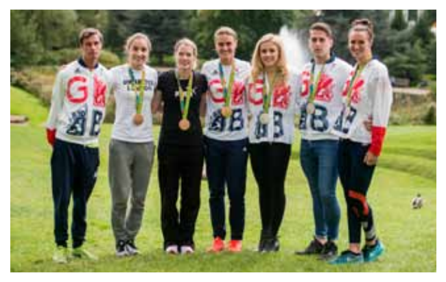
Medal winners included members of the British Swimming National Centre who train at Bath.