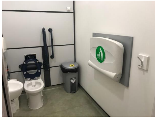
Pictured above: Example of signage and the inside of the room (0.4B in East Building)

A room dedicated for the use of expectant and nursing mothers as well as for treating any health conditions that require applying medicine/resting during the work day is available in Wessex House 3.47A. This room (with a 'rest room' sign on the door, see picture below) contains a bed to aid relaxation, a chair for milk to be expressed and a fridge for storage. Further information, including how to gain access to the room, can be obtained from Health & Safety Technical team, Human Resources