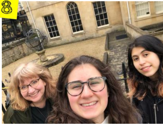
Stop 8: Admiral Arthur Phillip Memorial Globe, Bath Assembly Rooms, Bennett Street

“It is he who sits above the circle of the earth ... who stretches out the heavens like a curtain, and spreads them like a tent to dwell in.” (Isaiah 40:22)