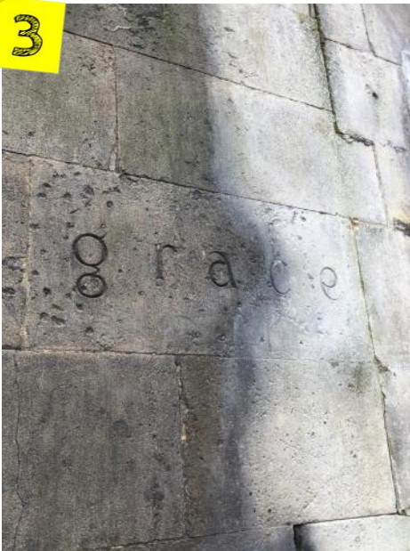
Stop 3: Grace Stone, Lower Bristol Road

“For it is by grace you have been saved, through faith - and this is not from yourselves, it is the gift of God - not by works, so that no one can boast.” (Ephesians 2:8-9)