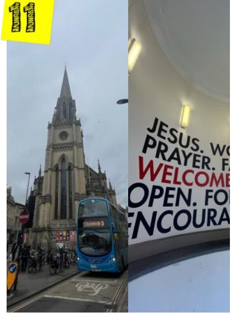
Stop 11: St Michaels Without, Broad St.

“Let the word of Christ dwell in you richly; teach and admonish one another in all wisdom; and with gratitude in your hearts sing psalms, hymns and spiritual songs to God.” (Colossians 3:16)