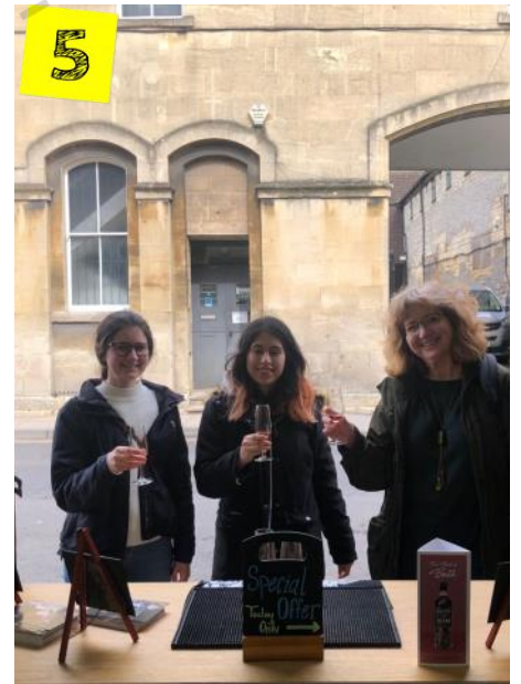
Stop 5: The Bath Distillery, 23-24 Monmouth Place

“But whoever drinks the water I give them will never thirst. Indeed, the water I give them will become in them a spring of water welling up to eternal life.” (John 4:14)