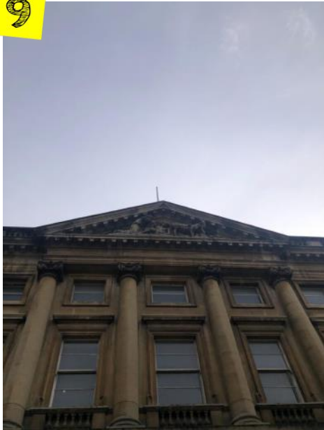
Stop 9: Good Samaritan, Royal National Hospital for Rheumatic Diseases, Upper Borough Walls, Bath

“But a Samaritan, as he travelled, came where the man was; and when he saw him, he took pity on him. He went to him and bandaged his wounds, pouring on oil and wine. Then he put the man on his own donkey, brought him to an inn and took care of him.” (Luke 10:33-34)