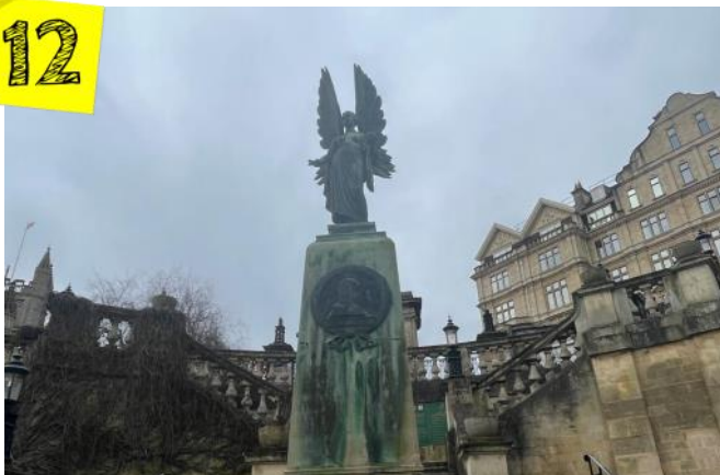
Stop 12: Angel of Peace, Parade Gardens

“And the Angel said unto them, fear not: for, behold, I bring you good tidings of great joy, which shall be to all people.” (Luke 2:10)