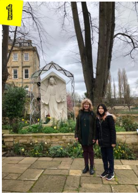
Stop 2: Mary Statue, St John's Church

“They all joined together constantly in prayer, along with the women and Mary the mother of Jesus, and with his brothers.” (Acts 1:14)