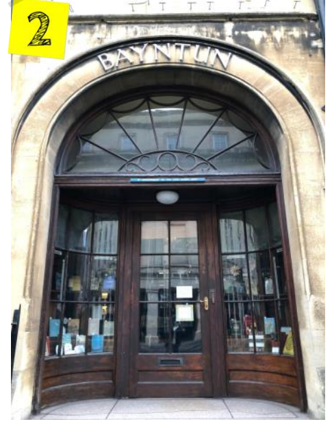
Stop 2: Bayntun Books, Manvers Street

“Jesus did many other things as well. If every one of them were written down, I suppose that even the whole world would not have room for the books that would be written.” John 21:25