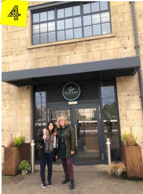
Stop 4: Mokoko Coffee Shop, Newark Works, Foundry Lane, Lower Bristol Rd

“Then Jesus declared, ‘I am the bread of life. Whoever comes to me will never go hungry, and whoever believes in me will never be thirsty’.” (John 6:35)