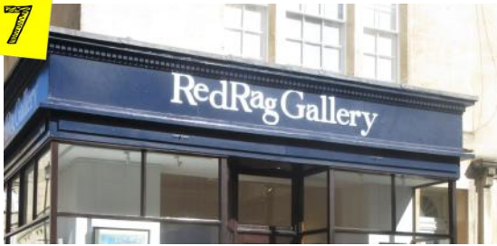
Stop 7: Red Rag Art Gallery, 24 Brock Street

“He has made everything beautiful in its time.” (Ecclesiastes 3:11)