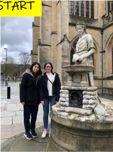
Start: Rebecca Statue, Bath Abbey

“Like cold water to a thirsty soul, so is good news from a far country.” (Proverbs 25:25)