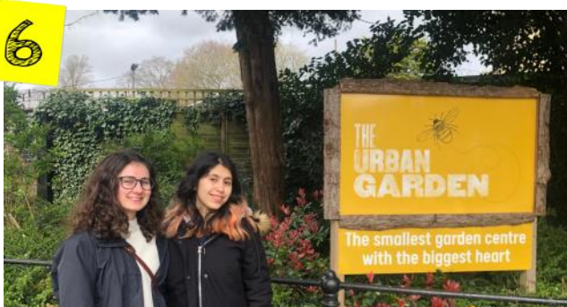
Stop 6: Urban Garden Centre, Victoria Park

“He asked her, ‘Woman, why are you crying? Who is it you are looking for?’ Thinking he was the gardener, she said, ‘Sir, if you have carried him away, tell me where you have put him, and I will get him’.” (John 20:15)