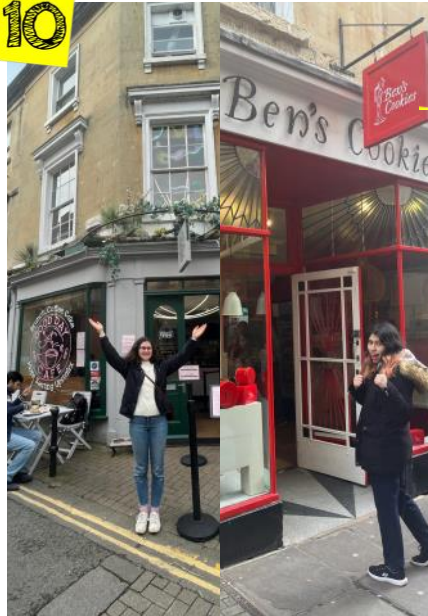
Stop 10: Good day Cafe & Ben's Cookies, Union Passage

“He gives food to every creature. His love endures forever.” (Psalm 136:25)