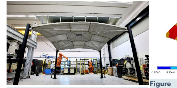
concrete thin-shell

models can be used to estimate the structural behaviour of new samples. While ML models are not as accurate as FE analysis, they can make predictions in less than a second. Such a trade-off between speed and accuracy would enable several new applications in the design and production