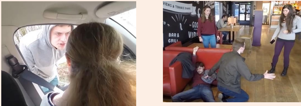
Figure 2. Stills from the theft and bar fight videos

Participants were interviewed with either a control (standard police) interview or Wafa interview by one of three interviewers who were trained in accordance with the UK investigative interview model ( PEACE ) and Achieving Best Evidence guidance (Home Office, 2011).