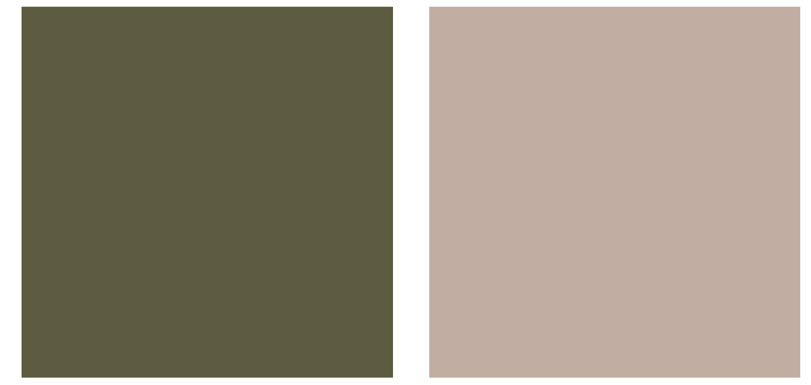
Connection Xpresso Military Green Connection Xpresso Sand