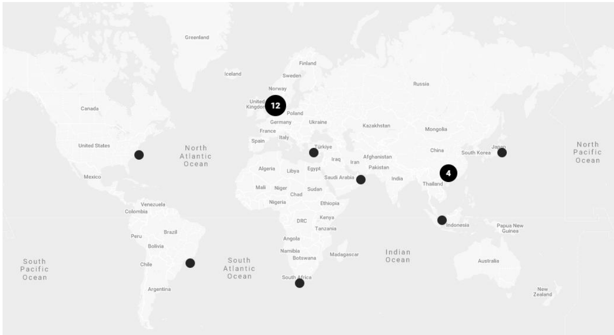
Fig 1. Presence of Körber Business Area Technologies, taken from its website