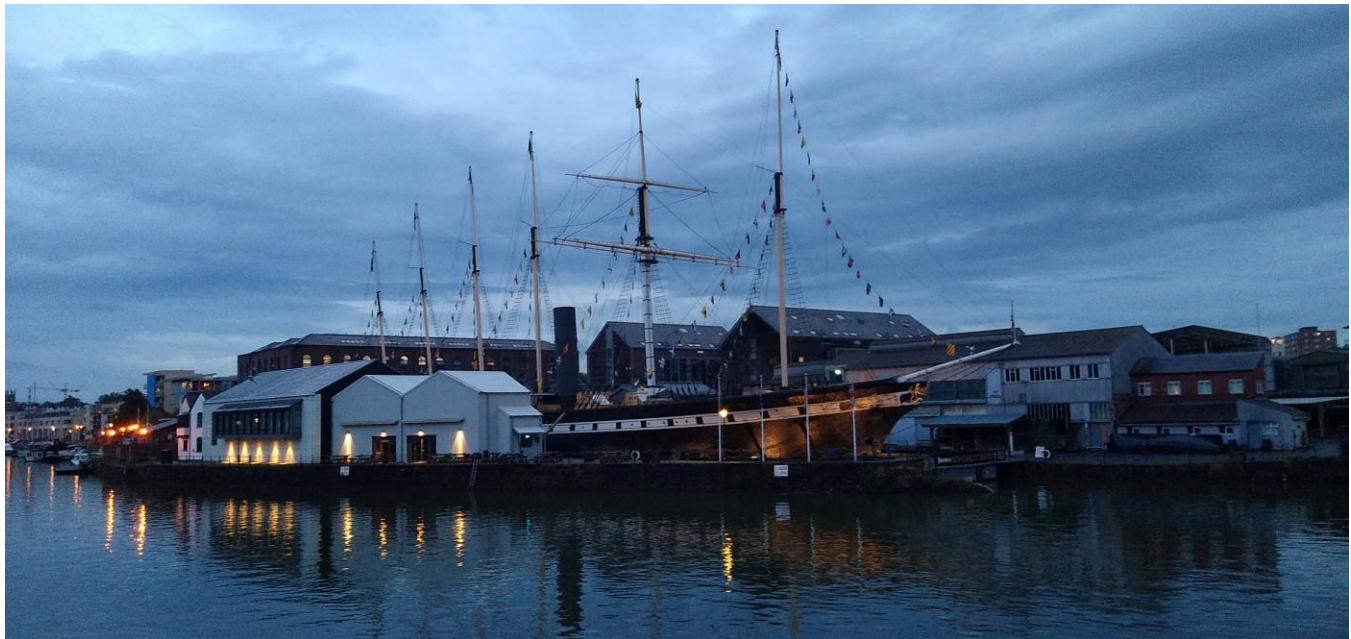
“SS Great Britain, Bristol Harbour”

We will take coaches to the Bristol harbour, where the SS Great Britain is dry docked. You will have the opportunity to explore this historic vessel, then we will have drinks on the deck of the ship, followed by the gala dinner in the formal dining room.