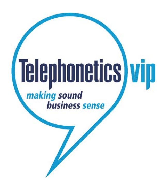
Getting Started Guide