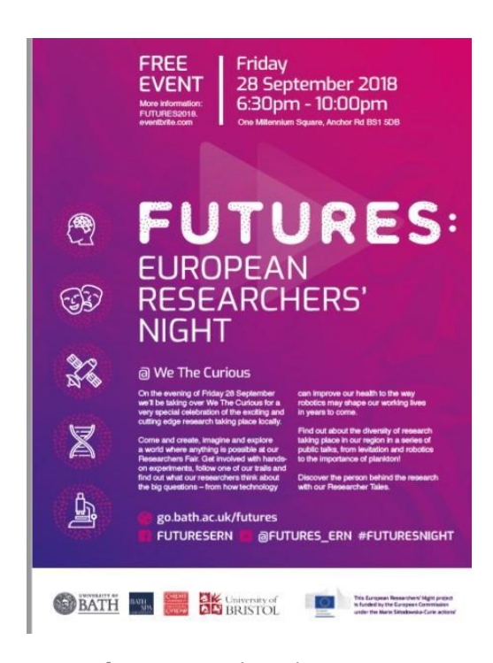
Figure 7: Copy of a poster used to advertise FUTURES 2018