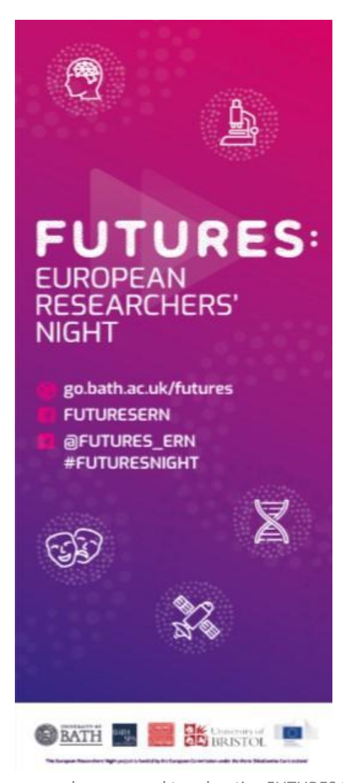
Figure 8: Copy of a pop up banner used to advertise FUTURES 2018