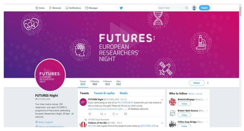
Figure 2: A screenshot of the FUTURES 2018 Twitter page

engage existing audiences in addition to building new ones. The hashtag #FUTURESNight was used before and during the events. A total of 416 followers were gathered during the campaign and 402 tweets were shared through the account. The hashtag was used 1983 times during the build up to and throughout the events. Tweets came from 945 unique accounts with a potential maximum reach of 1,825,050. Sentiment analysis found 99.2% of these tweets were positive or neutral.