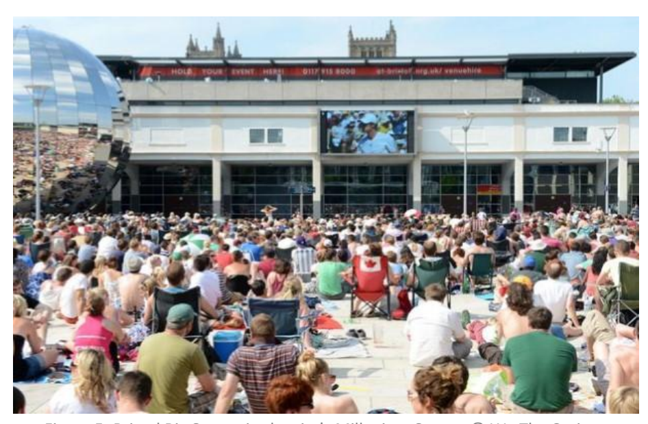
Figure 5: Bristol Big Screen in the city's Millenium Square