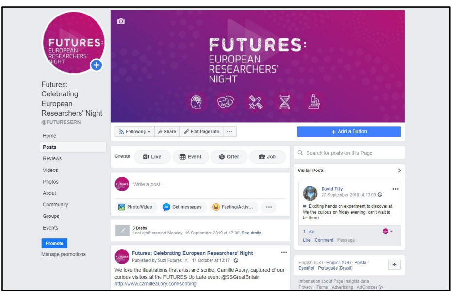
Figure 6: A screenshot of the FUTURES 2019 Facebook page

Through the FUTURES <u>Facebook</u> page the awareness campaign involved a mixed methods approach, posting FUTURES related content and running a series of paid-for adverts directed at regional and local community interest groups and pages. During the campaign the FUTURES page gained 63 likes and the 45 posts reached 799,326 Facebook users and gained 1,084 engagements including Likes, Shares, Comments, media views and link clicks. The approach meant the FUTURES Facebook page reach 880,041 Facebook users and potentially made an impression on 1,700,000 user's feeds.