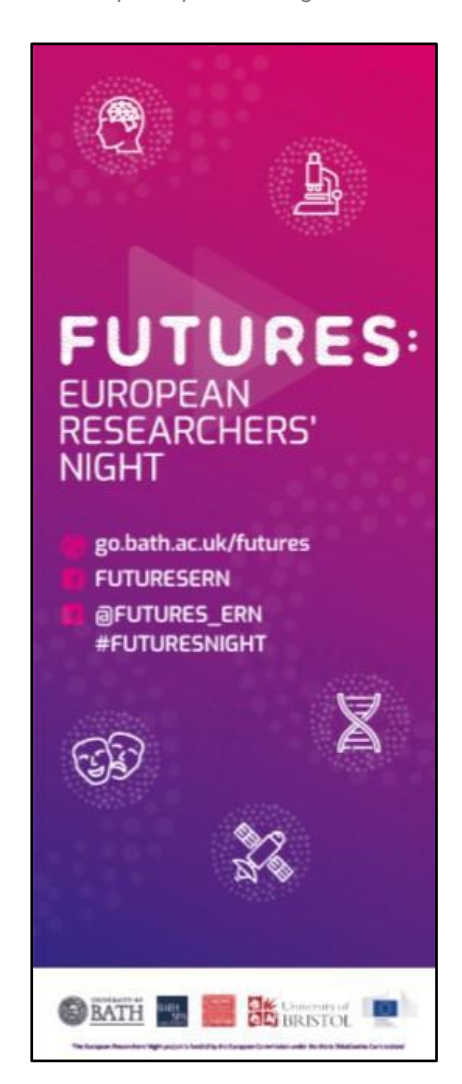
3. Example of pop-up banner used at participating venues