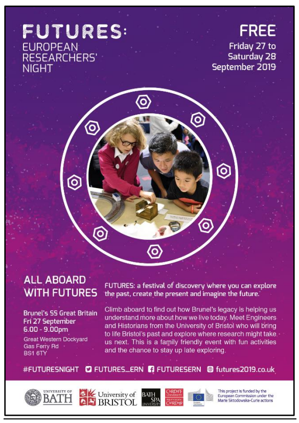
2. Example of poster design for FUTURES events