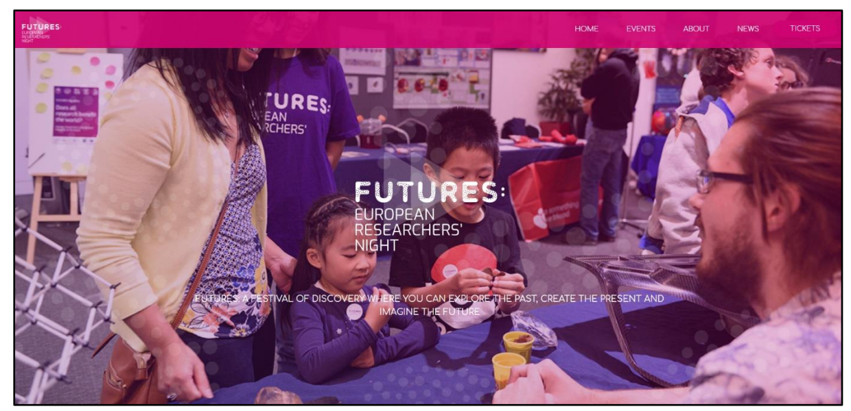
Figure 2: futures2019.co.uk Home page