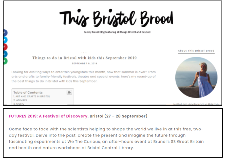
Figure 7: Media coverage of FUTURES in Bath Echo, Bristol 24/7 and This Bristol Brood