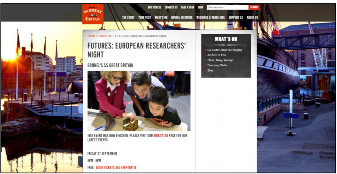
Figure 9: Promotion of FUTURES Up Late on SS Great Britain's What's On page

Brunel's SS Great Britain also promoted FUTURES on its Facebook page and Twitter feed (nearly 13,000 followers) with both its own content and sharing FUTURES content and was a co-host for the Facebook event page with exposure to nearly 12,000 people. Posters and flyers were also displayed at the venue which has around 15,000 visitors per month.