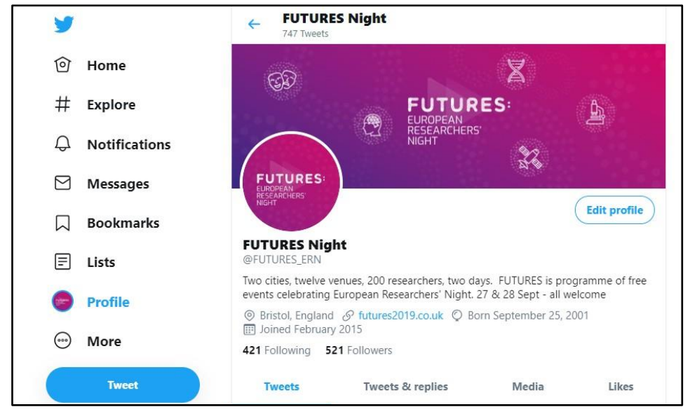
Figure 5: A screenshot of the FUTURES 2019 Twitter page

During the campaign, the Twitter account (<u>@FUTURES_ERN</u>) posted 209 tweets which were shared by accounts with a maximum total potential reach of 1,200,000. During the campaign, the account gained 100 new followers. The two hashtags #FuturesNight and #FuturesNight2019 were used 1,440 times during the campaign in the run up to and during events.