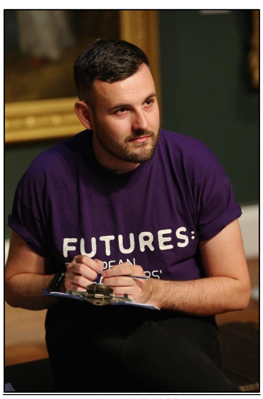
5. Volunteer wearing a FUTURES branded t-shirt