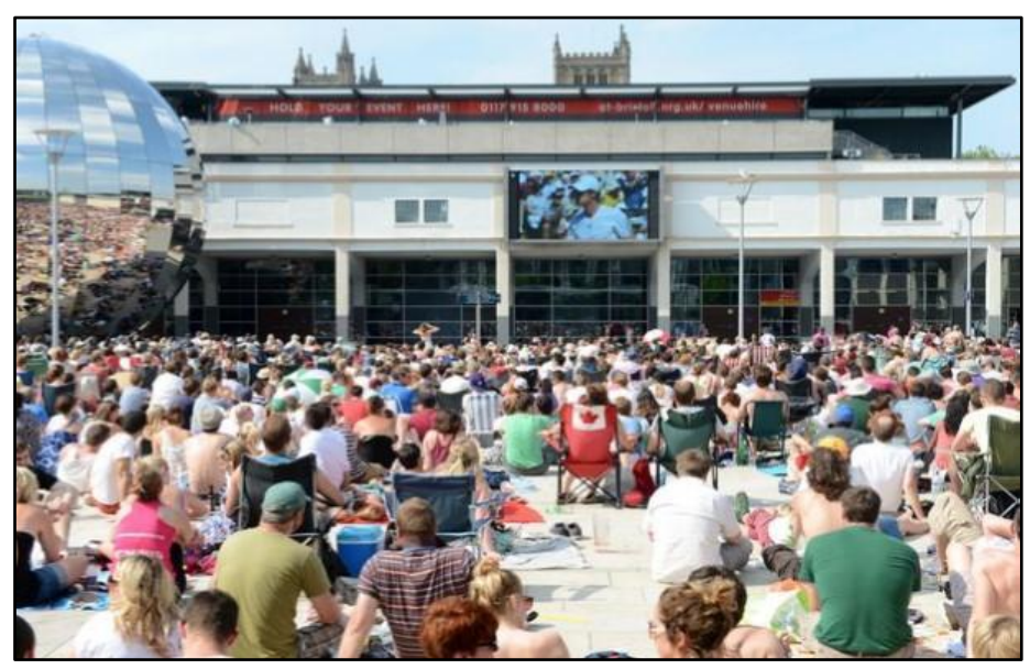
Figure 8: Bristol Big Screen in the City's Millennium Square

We The Curious also provided free use of Bristol's Big Screen television located on Millennium Square outside the venue. The FUTURES film, promoting the event at We The Curious, was screened between the beginning of June and end of September as part of its ongoing rotation of content. This had a reach of approximately 1.25 million people, based on the average footfall through the square. However, we are confident this number could be considerably higher, because the film ran through the summer months when several high-profile events, which are attended by thousands of people, were hosted at the site such as the <u>Festival of Nature</u> and <u>Bristol Harbour Festival</u>.