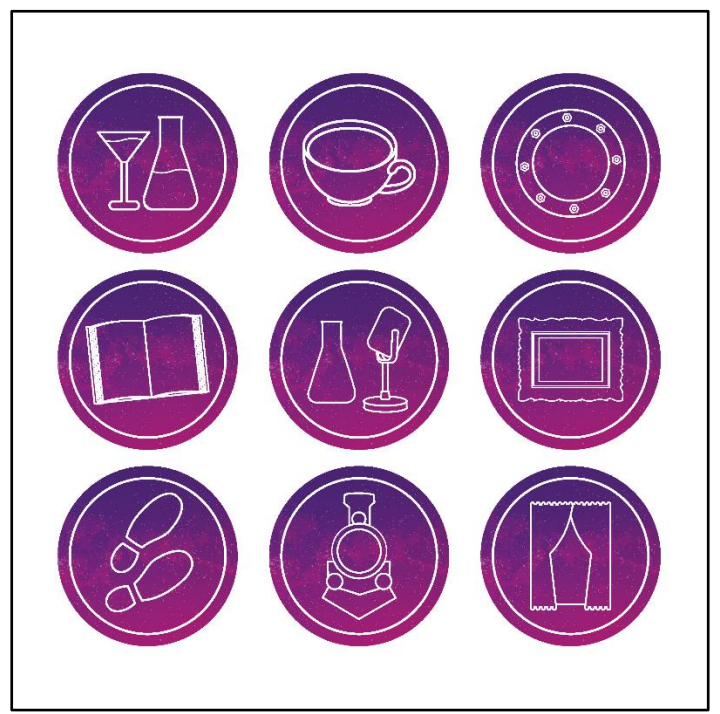
4. Example of FUTURES stickers handed out at events