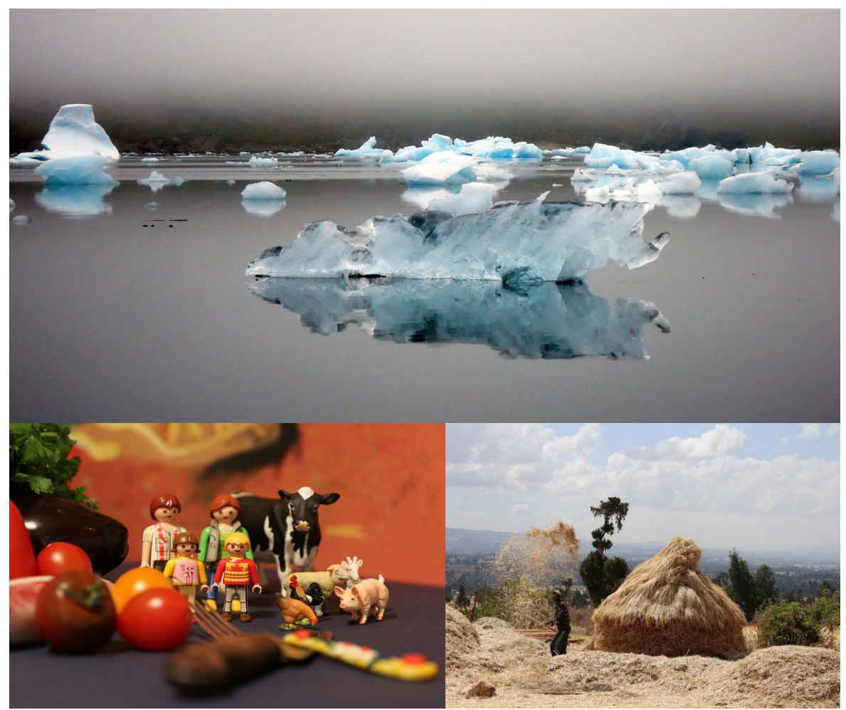
using to engender a change in culture.

During the Catalyst project, the Public Engagement Unit was at the centre of facilitating culture change towards a more inclusive approach to engaged research. Our journey was one of perpetual 'try, reflect, adapt and try again'. As we worked with our academic community and other professional services teams, we adapted and evolved our approach and the activities that we were