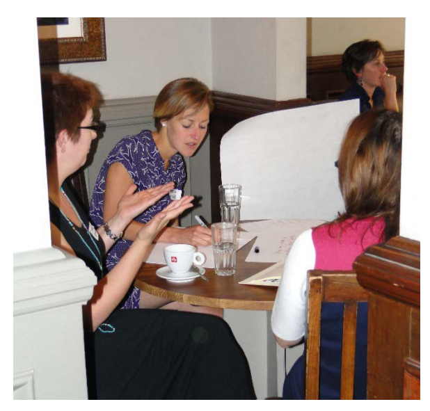
1. Developing ideas for new platforms for public engagement

"I think that's primarily what having a Public Engagement Unit does: it lets researchers know that public engagement is important. The university is putting resources into it; there's such a thing called a Public Engagement Unit...that shows that it's particularly important." Associate Dean for Research