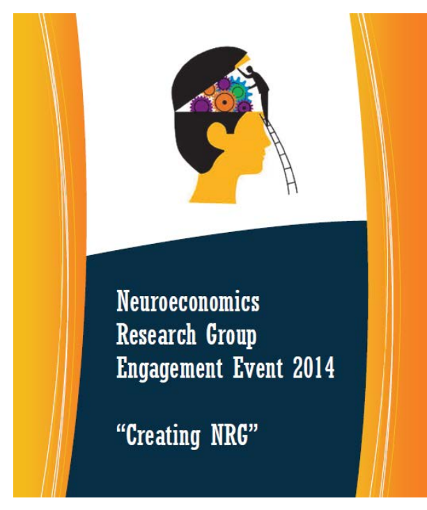
9. NRG Engagement Event Poster

The Public Engagement Unit's showcase event in November 2013 provided an opportunity for me to publicise the role of the Public Engagement Unit to my colleagues. Several of us displayed posters of our Public Engagement work at this event. Furthermore, in 2014, I ran a lunchtime discussion seminar on Public Engagement with Industry, attended by colleagues from across the University, some of whom were already engaging with Industry, while others were interested in learning about 'how to do it'. We talked about the benefits and costs of engaging with Industry. We discussed confidentiality issues, the differing pressures and timetables faced by academics and industry practitioners, the differing expectations of the parties involved, the skills involved for the academic in translating academic research into industry language, and the overall tensions for the academic in managing the relationship. I emphasised that, in my experience, it should be made clear from the beginning that the academic/practitioner research relationship should be one of open communication and two-way cooperation: this is genuinely a cooperative and collaborative relationship: it is NOT an exercise in consultancy! As a result of this lunchtime discussion, I wrote a piece for the Public Engagement Unit webpages on "My Experiences of Engaging with Industry."